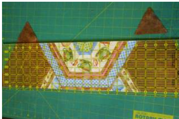
20. Here on Rows 2 through 5, you will cut off the excess background fabric as shown.