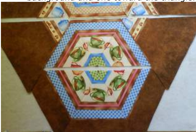
19. Now start sewing your rows together.