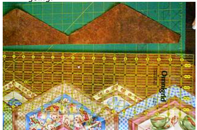
22. Now you can lay your long ruler along the side of your table runner and even up the edge.