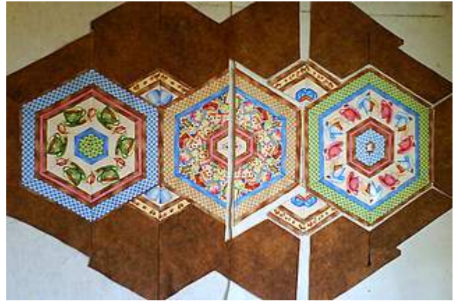
21. It's all going together beautifully! Keep going!