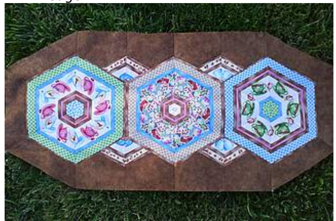
23. Pat yourself on the back and take a deep breath. Admire your wonderful self!